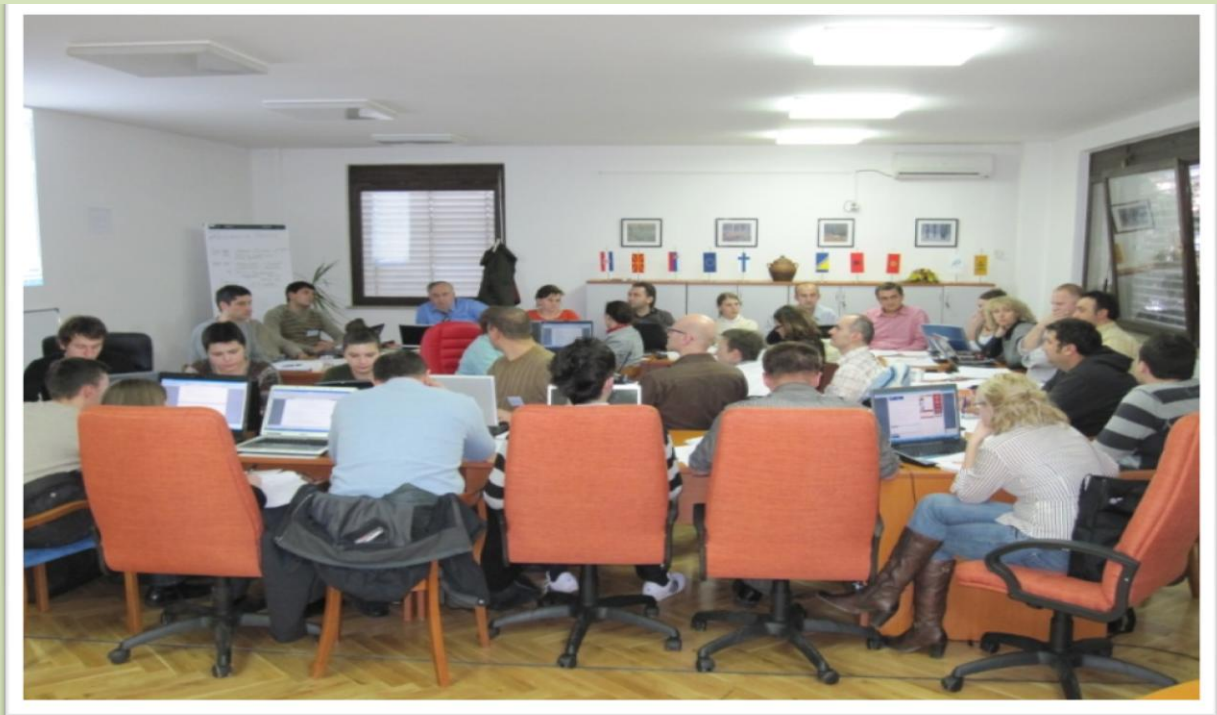
FOPER II Meeting

FOPER II Master Course starts in September