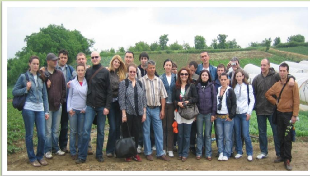
FOPER I Generation at a fieldtrip