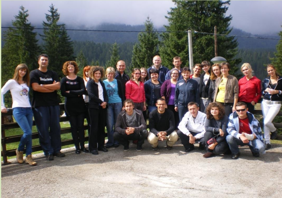
FOPER II M. Sc Generation